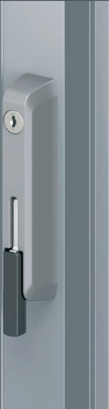
Lever & key locking system