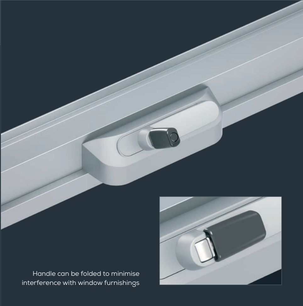
Handle can be folded to minimise interference with window furnishings