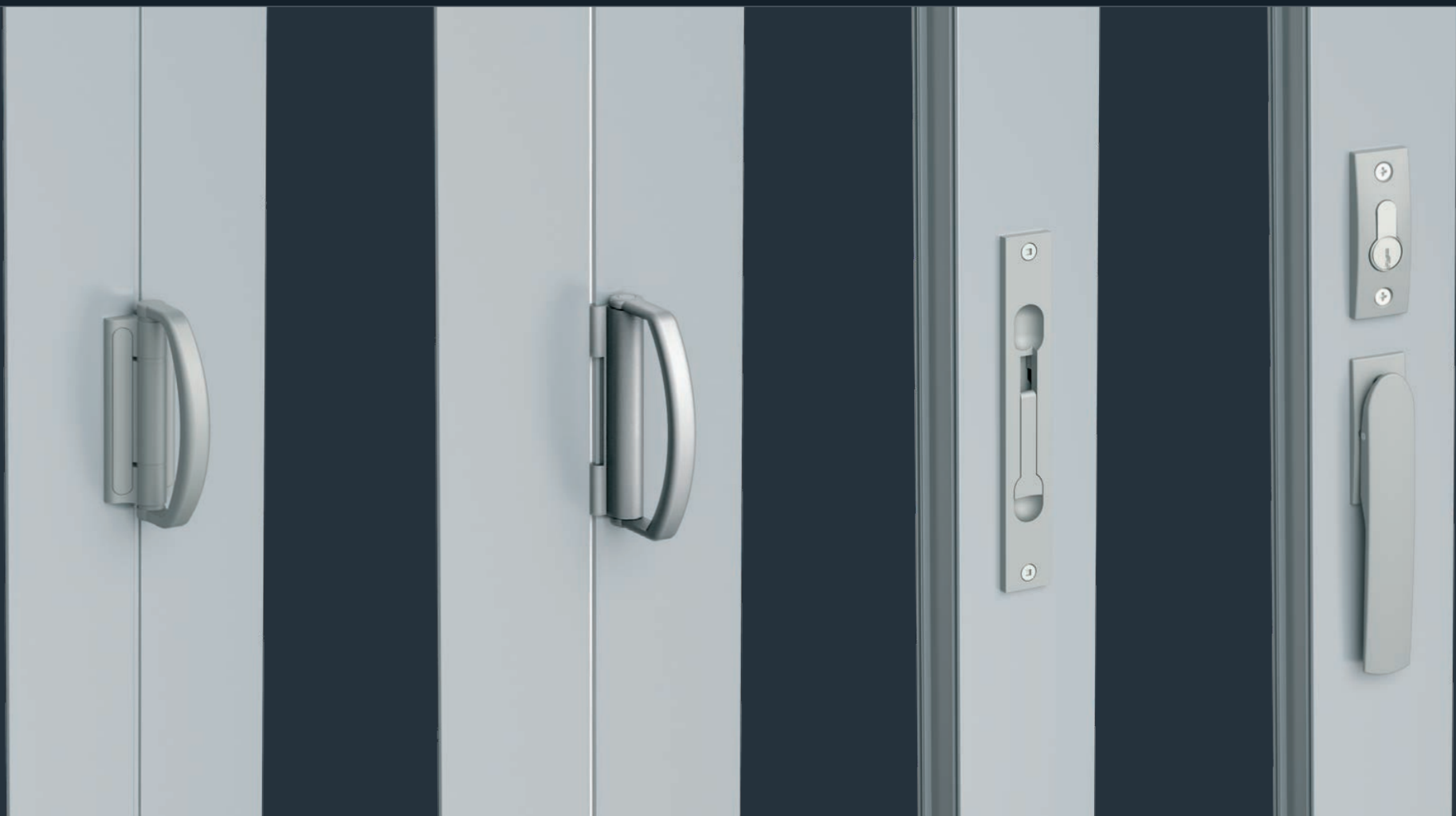
Twin bolt lever